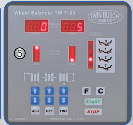
(1) Side holder for centering cones and gauge (2) Integrated distance measurement (3) Quick release nut \varnothing = 40 mm (4) 15 storage compartments (5) Digital Display (The new, compartment design ensures maximum user comfort and optimal ergonomics)