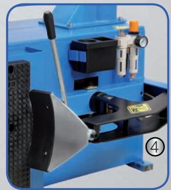
(1) Two help-arms for more efficiency (2) Powerful air jets in all clamping jaws (3) Large clamping range (4) Powerful bead breaker