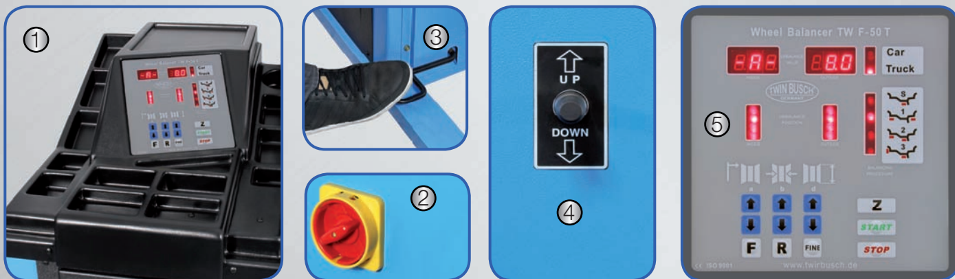
(1) 13 storage compartments (2) ON/OFF switch (3) Foot brake (4) Convenient joystick control (5) User friendly keypad for easy data input, slanted display for optimal readings