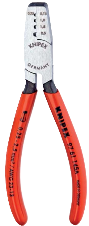
Art.-No. 97 61 145 A