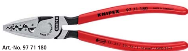
Art.-No. 97 71 180