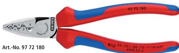
Art.-No. 97 72 180