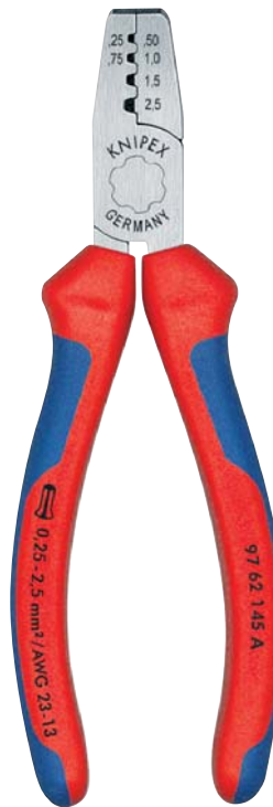
Art.-No. 97 62 145 A