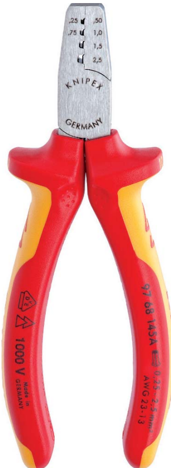
Art.-No. 97 68 145 A