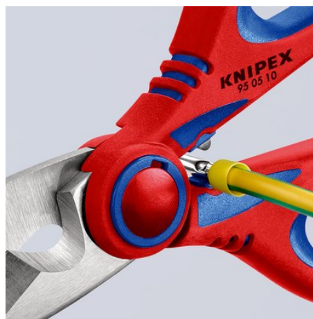
95 05 10 SB: Fast, easy crimping