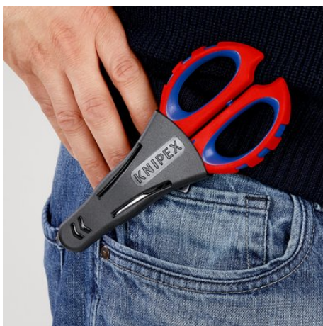
Securely stowed and always at hand